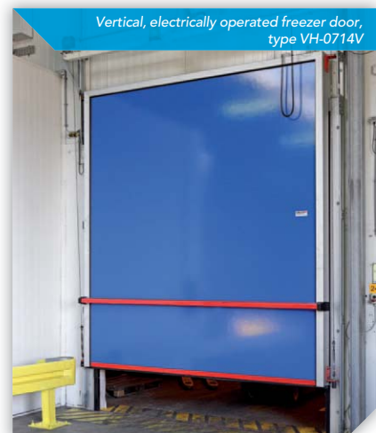
Vertical, electrically operated freezer door, type VH-0714V