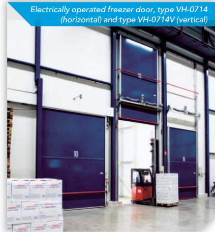
Electrically operated freezer door, type VH-0714 (horizontal) and type VH-0714V (vertical)

Additional options : door leaf constructed of steel sandwich panels in standard colour RAL 9002 (light grey), special stainless steel version (see stainless steel documentation), flexible threshold (a so called sliding dowel construction), bumper, finish of the clear opening, rain cap and more.