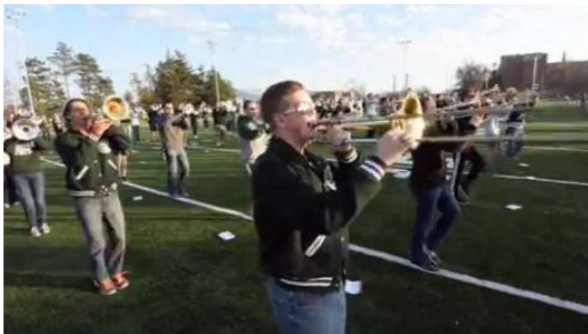
The Spartan Marching Band is presenting an extravagant halftime show during Saturday's football game against Maryland.

The performance will be held when the Spartans (8-1) take on the Maryland Terrapins (2-7) at noon Saturday.