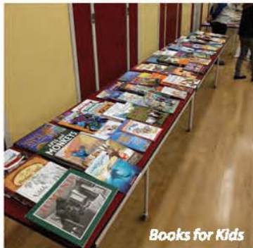
Books for Kids