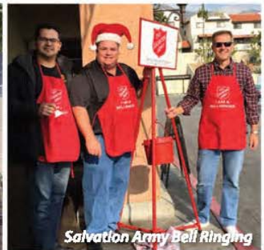
Salvation Army Bell Ringing