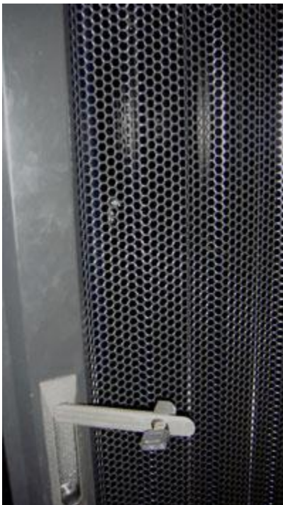
Vented Front/Back Doors