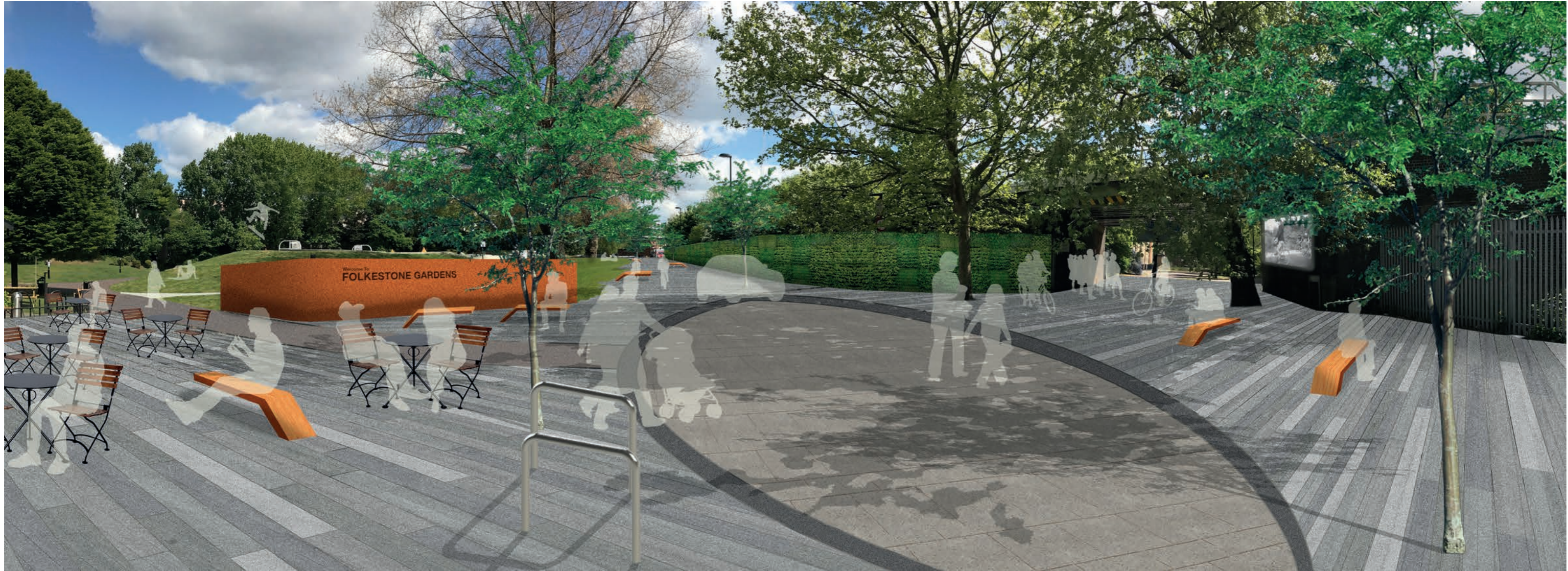
Visualisation of Rolt St from Festa Sur Prato looking east